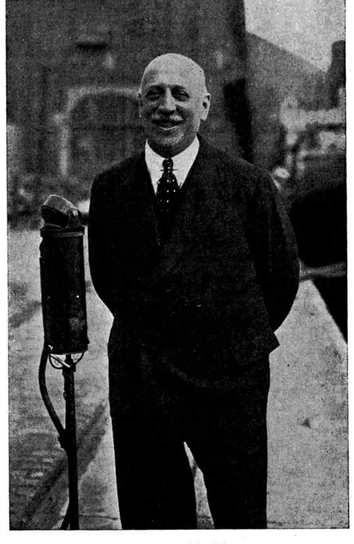
MAJOR DOUGLAS 'Greatest Economist'

"With a full appreciation of the gravity of what I am saying, I am convinced that in the case of the ring of international financiers who control the system the conscious objective is to keep the great mass of the population in fear of poverty and of loss of